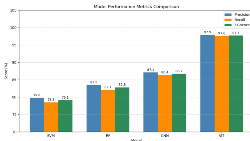
Figure 2: Model Performance Metrics Comparison.

To evaluate how well each model performed across all classes, precision, recall, and F1-score metrics were calculated and summarized in Table 2. The ViT achieved the highest values across all three metrics, followed by CNN. SVM and RF exhibited noticeably lower performance, particularly in recall and F1-score, due to difficulties in identifying early-stage disease symptoms.